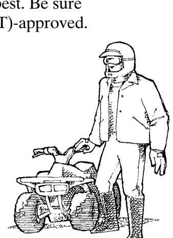
(Continued on back)

Note to trainer: Hands-on ATV rider training is available nationwide through the ATV Safety Institute. Call 800/887-2887 for information.