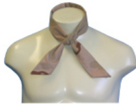
Product #6519 Color: Camo