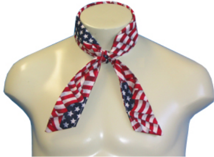
Product # 6519 Color: USA Flag