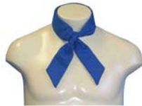
Product #6519 Color: Camo