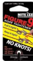
F9L-02-09 FIGURE 9 - LARGE SINGLE PACK