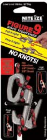
F9L-03-09 FIGURE 9 - LARGE SINGLE PACK WITH ROPE