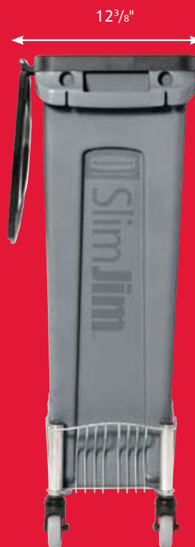
Slim Jim® with Hinge Lid and Stainless Steel Dolly

Molded-in handles, form-fitting stainless steel dolly, and sleek lid options improve Slim Jim's® functionality while maintaining its slim profile.