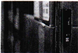
Monitors Humidity and Temperature level in a warehouse or storage room.