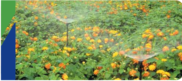
JetSpike™, pre-packaged with 12" extensions, rises above the rest.