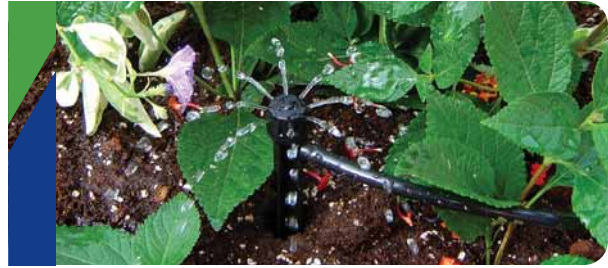
Gentle, efficient watering with the adjustable flow 8StreamSpike™.