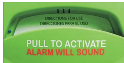
Alarm sounds upon both activation of the unit and completion of 15-minute flush