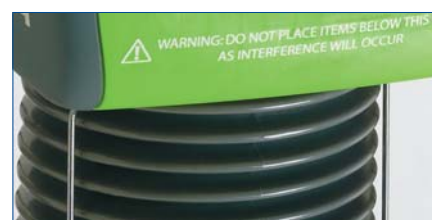
Reservoir collects waste solution for safety and easy disposal