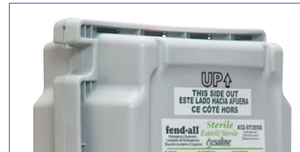
Easy-to-install single cartridge features 100% sterile saline