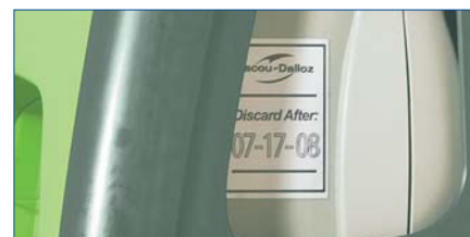
Full visibility is provided through the side window to quickly check expiration date